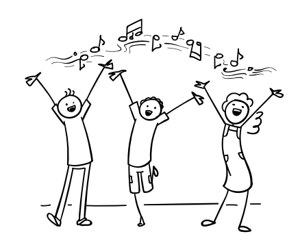
"Yesterday, yesterday, yesterday"